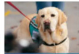
Brothers cycle across Australia for assistance dogs 12

On behalf of the veteran community, we would like to welcome Minister Gee to the Veterans' Affairs portfolio, and look forward to working with him to serve veterans and their families. We also acknowledge the former Minister, the Hon Darren Chester MP, for his service to the veteran community over the past 3 years.