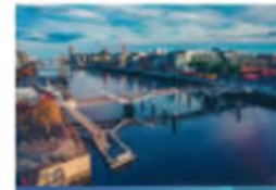
Excellences and services for veterans living overseas 22