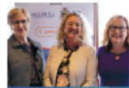
Launch of new online tool for transitioning ADF 16